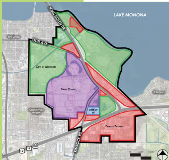
KEY PROPERTY OWNERSHIP