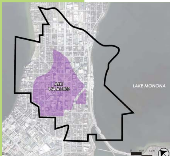
DISTRICT COMPARISON TO DOWNTOWN